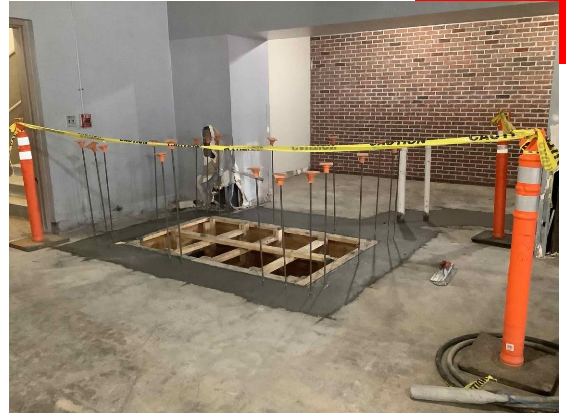
Elevator pit installation