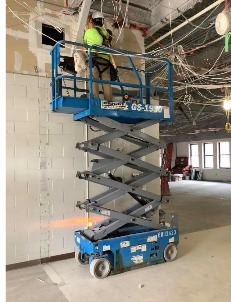
MEP overhead rough-in