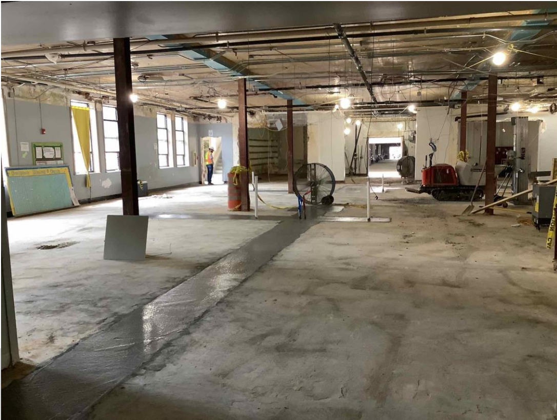
Plumbing rough-in pourback